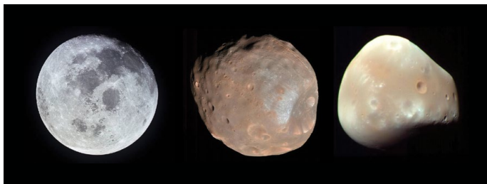
Figure 1. Images of Earth's Moon (left) and Mars's moons Phobos (center) and Deimos (right). Not to scale. The photos of Phobos and Deimos are color-enhanced.